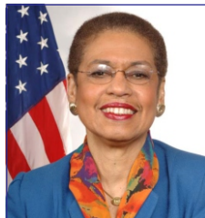
Congresswoman Eleanor Holmes Norton