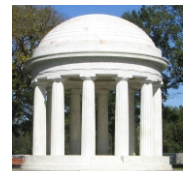
DC WAR MEMORIAL