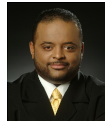
Roland Martin Host and Managing Editor Washington Watch with Roland Martin